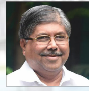
Hon. Shri. Chandrakant Patil Minister, Higher & Technical Education, Government of Maharashtra