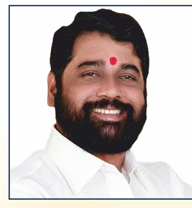
Hon. Shri. Eknath Shinde Chief Minister, Maharashtra State